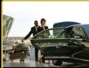
AIRPORT ROUND TRIP TRANSFER