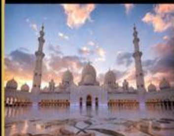
ABU DHABI TOUR