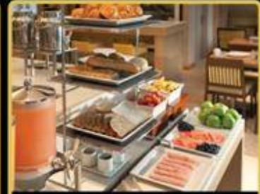
DAILY HOTEL BREAKFAST