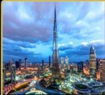
DUBAI CITY TOUR